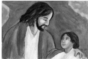
25TH SUNDAY IN ORDINARY TIME

Reflect, today, upon whether you are ready and willing to reach out to those in need among you. Who are they? What is their need? Do you seek them out and offer love and support? Doing this is what will make you truly great in the eyes of God.