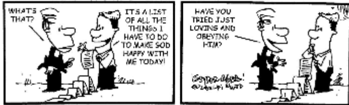
22ND SUNDAY IN ORDINARY TIME

Monday Adoration until 9:00pm Tuesday Reconciliation 8:00am Tuesday Daily Mass 8:30am Saturday Reconciliation 7:15pm Saturday Mass 8:00pm